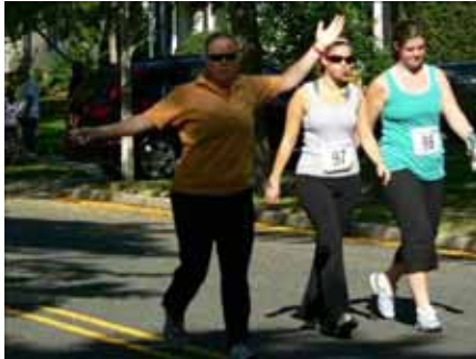
Interlaken 5K walkers