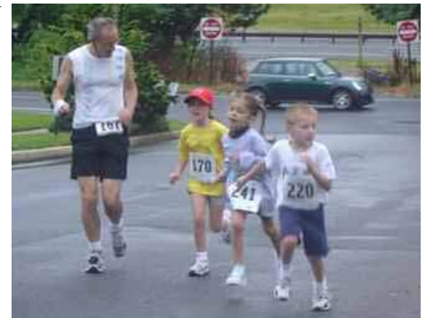
Bayshore Classic competitors