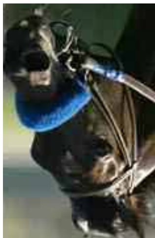
See details on page 7.

Newsletter of the Jersey Shore Running Club Issue XVI, Vol. 10 • November 2007 Postmaster: Dated material enclosed. Please deliver before October 26, 2007. Thank You!