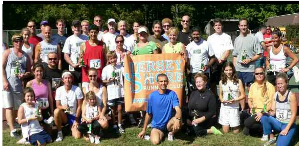
Interlaken 5K Award Winners