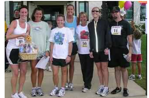
BSchool for children Awardd winners