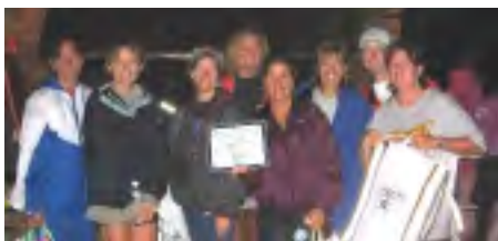
Wine, Women & Running pose for the camera of the Saturday in the Park Awards Ceremony.